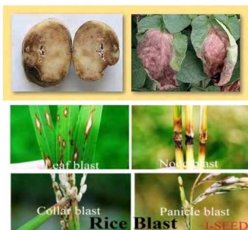
Figure 1: Potato blight and rice blast diseases

Fungi – pathogens that can be weaponized for use against crops to cause diseases such as rice blast, cereal rust, wheat smut, and potato blight . Rust is a plant disease caused by more than 4000 species of fungi and fungus like organisms of the phylum Oomycota. Rust affects many economically important plant species and usually appears as yellow, orange, red, rust-brown or black powdery pustules on leaves, young shoots, and fruits. In general, plant growth and productivity are commonly reduced, and some plants wither and die back. Blight , any of various plant diseases whose symptoms include sudden and severe yellowing, browning, spotting, withering, or dying of leaves, flowers, fruits, stems, or the entire plant.