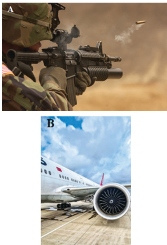
Figure 3. Polymer fibers in A) ballistic and B) aeronautical applications.

Kevlar fibers exhibit high degree of orientation along the fiber axis and belongs to the aromatic polyamide family. In ballistic applications, the human body behind the armor will bear a greater portion of the shock if the fibers are unable to absorb all of this energy without expanding too much. It would be of little use to the wearer to have a vest that could absorb the whole energy of a speeding bullet, but that needed to stretch out like a rubber band to do so. For ballistic fibers, tensile strength and tensile modulus are crucial characteristics. In the latest generation of lightweight, concealed body armors with significantly enhanced ballistic protection, Kevlar is a common material (Shih et al. 2022).