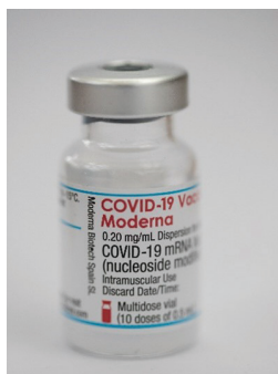
Figure 2. Vaccines containing PEGylated lipid nanoparticles.