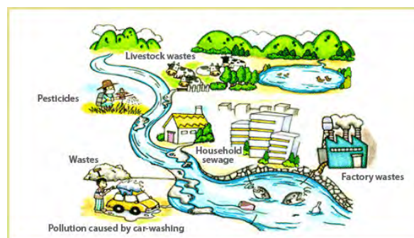
Figure 2: Water Pollution

Water pollution has become a severe environmental problem mainly due to the extensive anthropogenic activities: direct or indirect discharging of effluents containing toxic materials into water ways without proper treatment which causes chemical, physical and biological changes in water bodies. Hence, the depletion of suitable water quality causes life threatening waterborne diseases like cholera, typhoid, diarrhea, bowel diseases, and chronic illnesses in those people who rely on these water sources for their domestic activities.